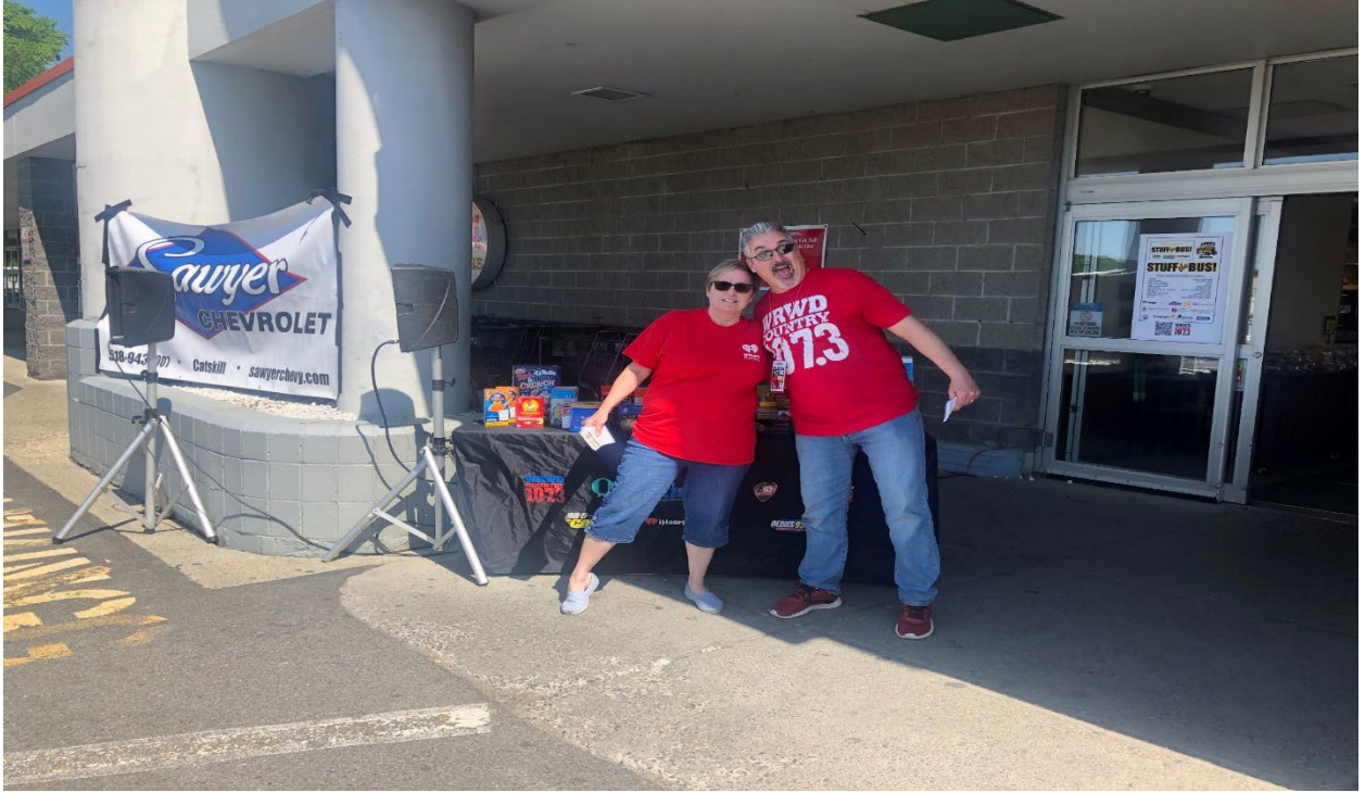
Community partners Clear Channel Radio, above, and Catskill Rotary Club, below, held food drives at the local Price Chopper in support of our food pantry