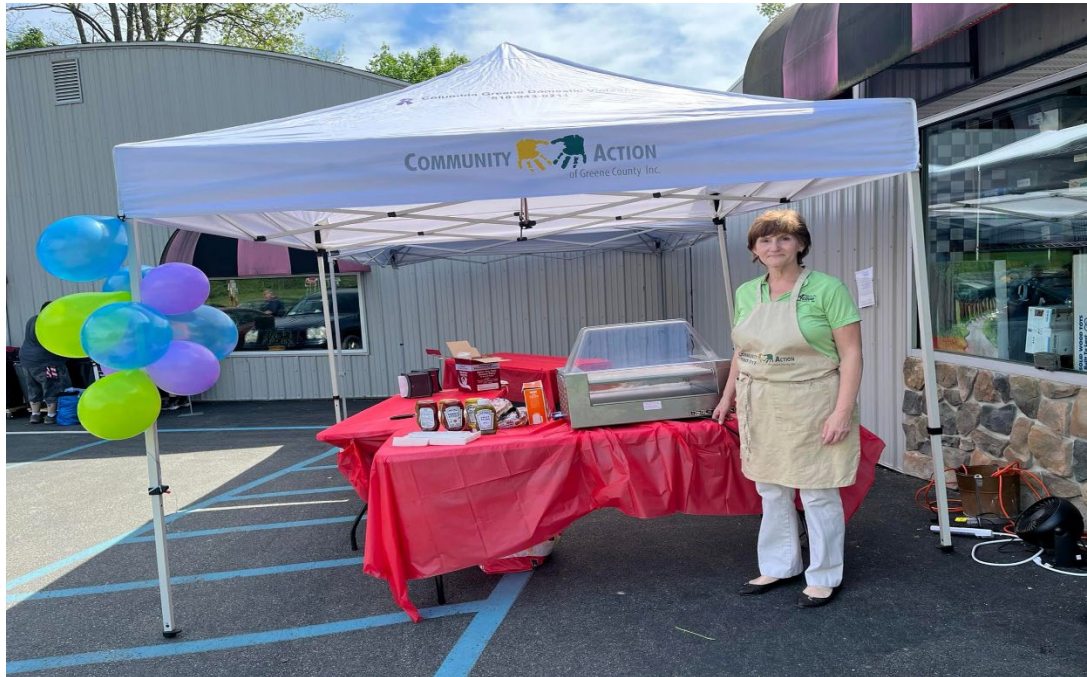
Free hot dogs and face painting was offered to community members to celebrate Pay it Forward Thrift Store's 10 th anniversary!