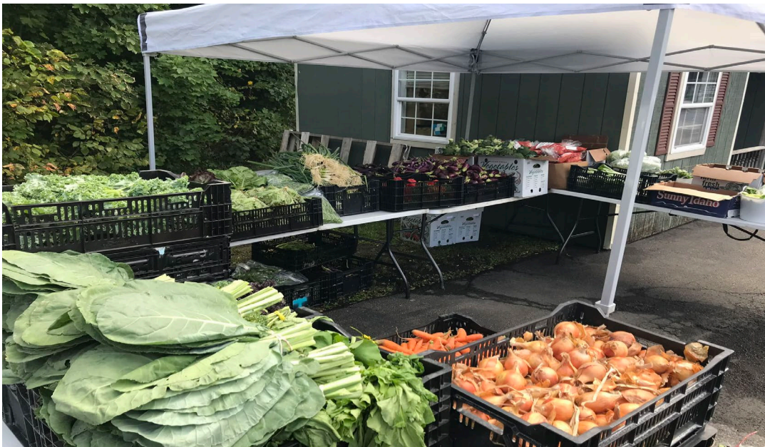
Free Farm Stand Tuesday provides fresh, local produce during harvest season to residents of Greene County