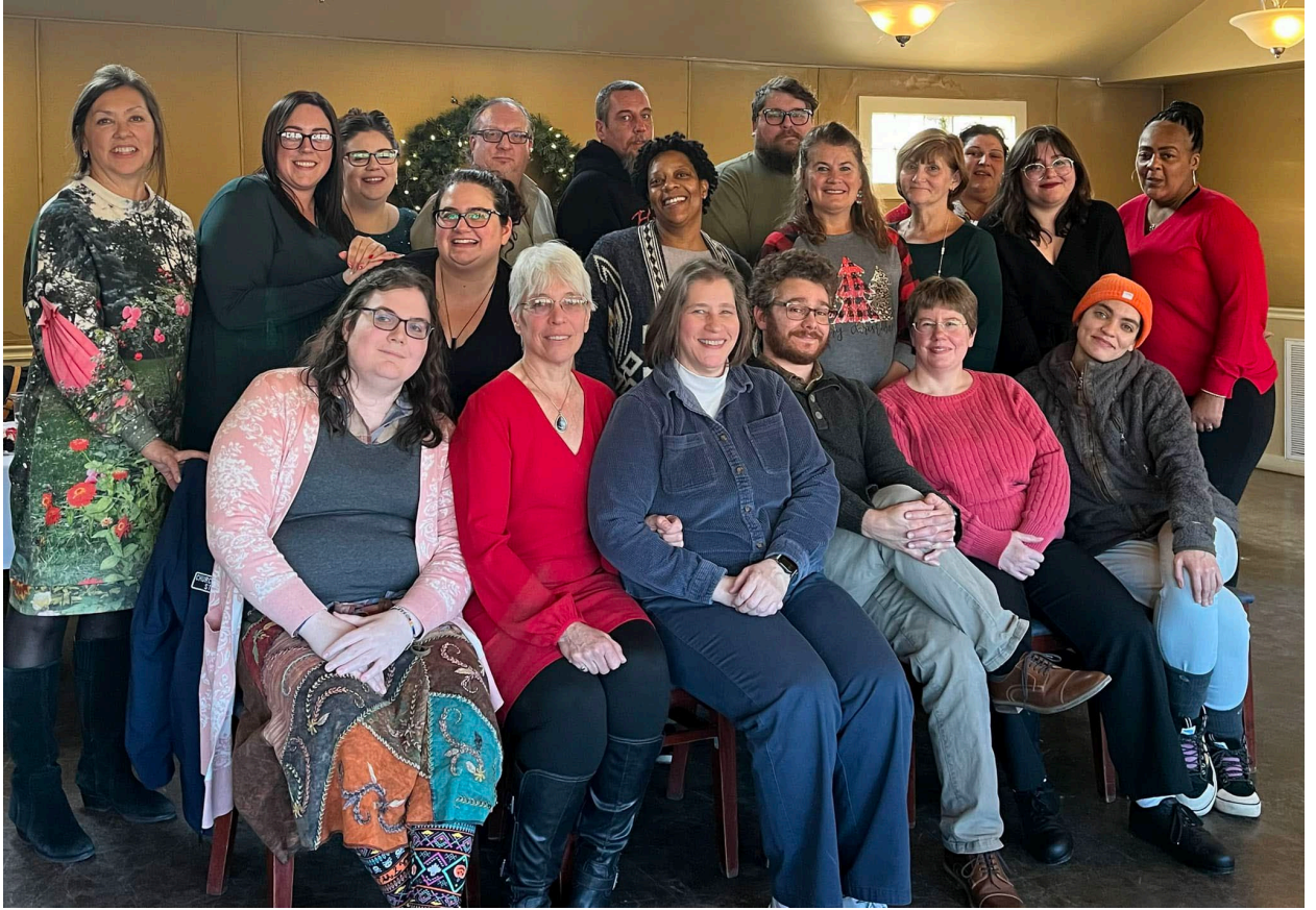
Like many organizations, the pandemic left us with fewer staff. This small but mighty crew celebrated the holidays together at Creekside this past December.