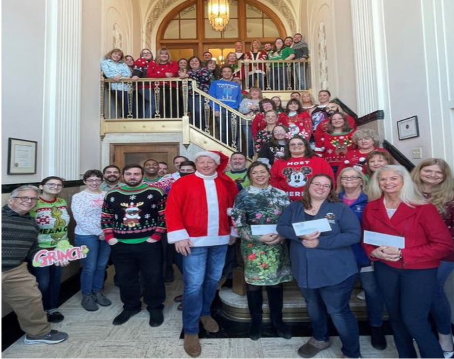
Staff of the Bank of Greene County opted to donate to organizations, including ours, rather than exchange gift on their "Ugly Sweater Day"