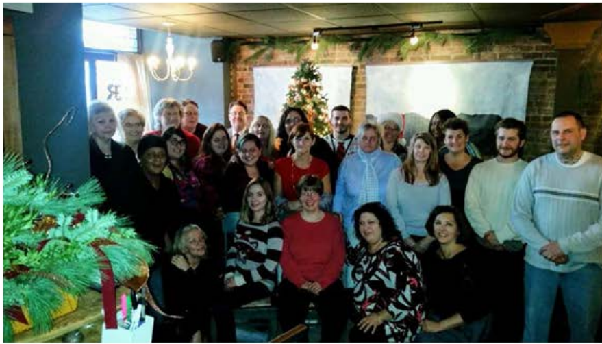
Staff of Community Action enjoy holiday luncheon at the New York Restaurant.