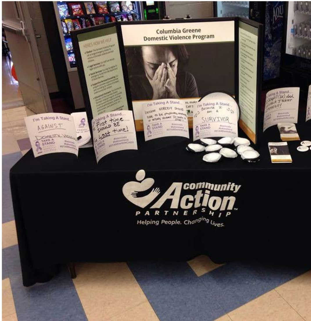
Taking A Stand against Domestic Violence at Columbia Greene Community College in October, National Domestic Violence Awareness Month