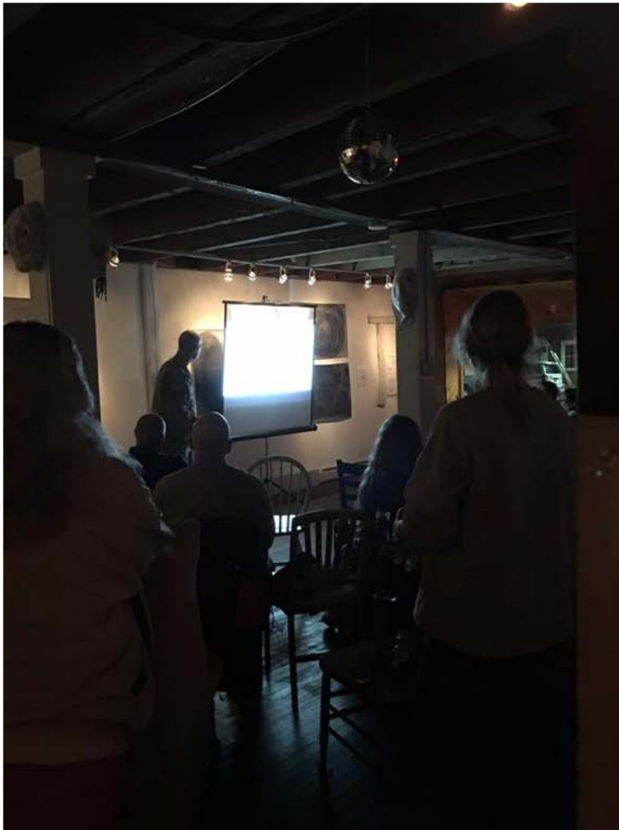
The NYS Citizens Preparedness Course held at the Prattsville Art Center in November.